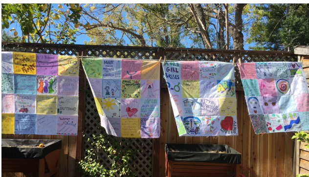
Quilts made by Listening Circle participants and Women's Wisdom Art

Much of our listening was conducted in partnership with women and girl's organizations, including the incorporation of a hands on art component facilitated through a partnership with Women's Wisdom Art . In this way, women and girls who might not speak their concerns verbally could draw their thoughts on fabric art squares which were later woven into quilt hangings.