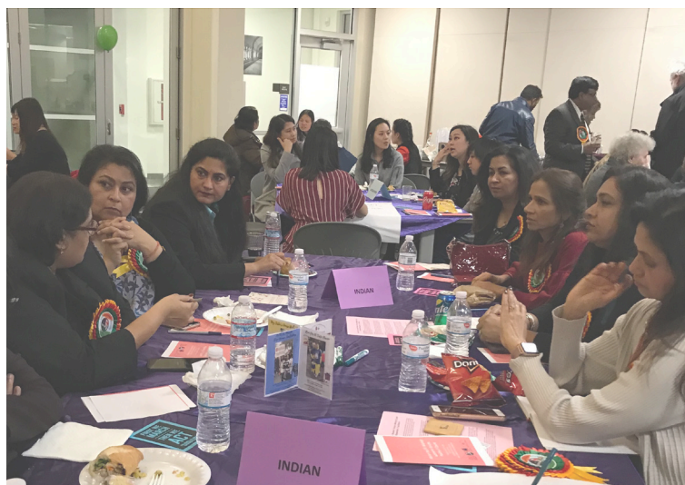
My Sister's House, OCA and IAS Listening Circle