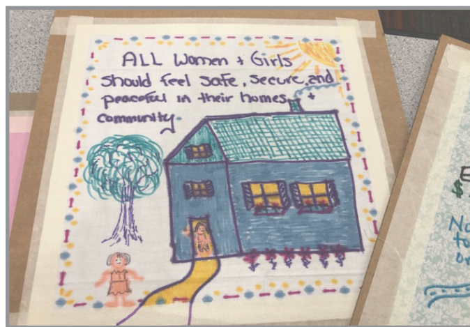
Quilt art from a "How Are The Women and Girls? Listening Circle participant

Today as we ask this question, we stand more hopeful, glimpsing the possibility that we can come together with purpose, focus, and intention to advance equity and opportunity through a permanent Sacramento County Commission on the Status of Women and Girls.