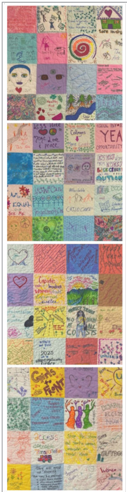
Quilts made by Listening Circle participants and Women's Wisdom Art