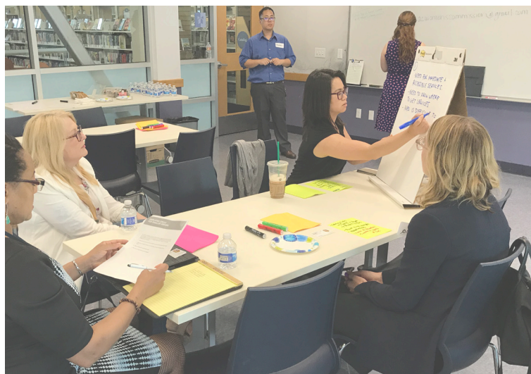
Sacramento State College of Arts & Letters Listening Circle