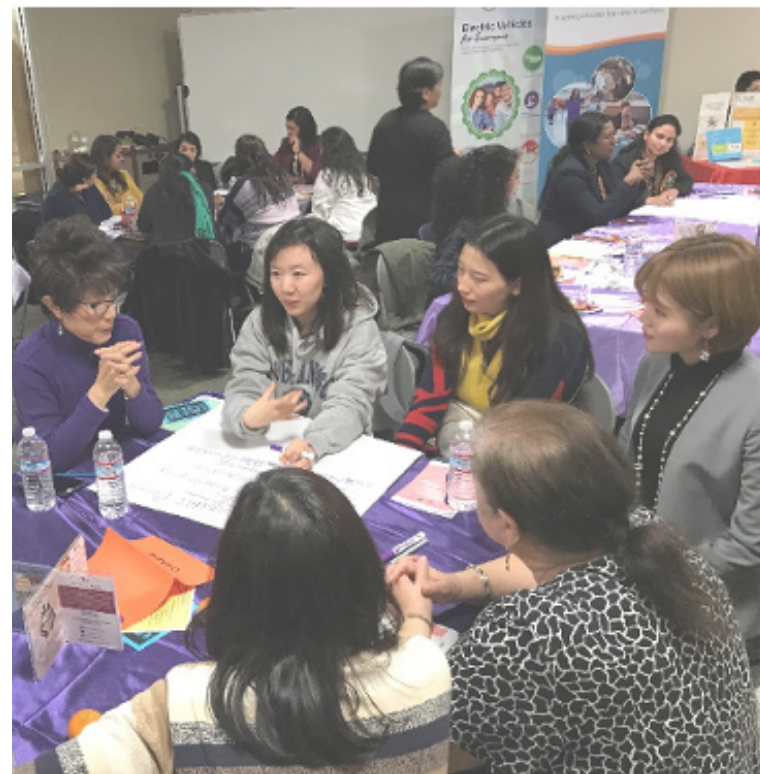
My Sister's House, OCA and IAS Listening Circle